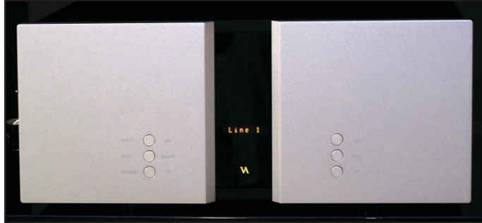
The understated new Vitus Audio Reference Series RI 101