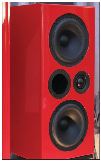
PranaFidelity's compelling Bhava, a "step-up" from his Fifty90

driver (1" exit) fitted to a 300 mm symmetrical horn. A 12-inch long excursion, paper cone woofer in a vented cabinet takes care of the low-frequency duties. Frequency response is roughly 25 Hz to 25 kHz, and the price is $22,000/pair.