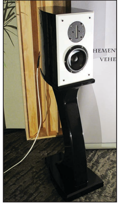
Vehement Audio's little champ, the Brezza EOS