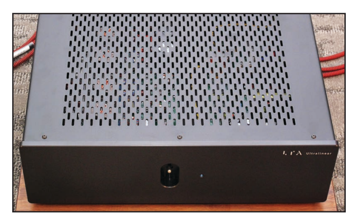
Linear Tube Audio's new ZOTL Ultralinear, in austere Fern & Robydesigned casework

A real hollow-state blast from the past is Western Electric, and its revival of the brand as well as WE 300B manufacturing (www.westernelectric.com). They brought along an interesting prototype to the show, a Class A2 single-ended integrated