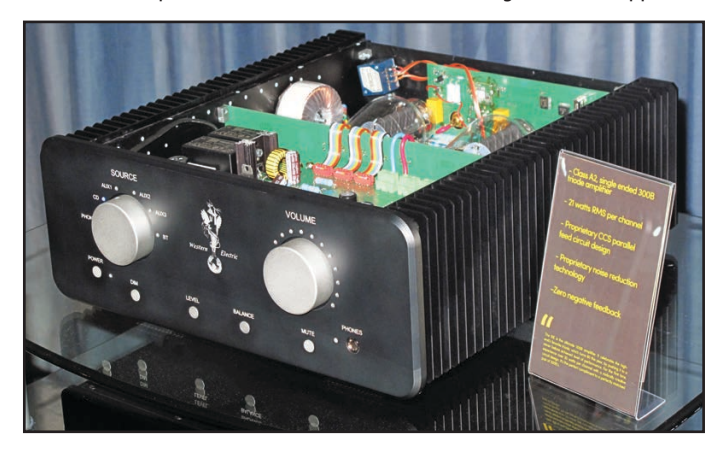
The homely but promising 91E prototype from Western Electric

amplifier with an MC/MM phono stage, no negative feedback, and microprocessor-controlled bias. The production 91E will run $9,995 and makes "20+" watts of yummy, dual triode goodness.