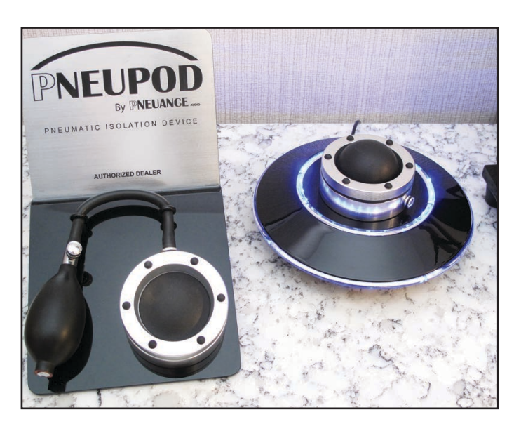
Pneuance Audio's Pneupod

a fad or simply good design sense?". He stressed that frequency extension alone is not enough, and cautioned that "…an amplifier with a wide bandwidth is also more susceptible to Radio Frequency Interference (RFI). Its design must include adequate RFI protection in our increasingly (RFI-) polluted world." Doshi also added that a "… phase margin for stability into less than ideal loads and low output impedance for control over tough loads" are also recommended. His new Doshi Amplifier exhibits frequency response within 1 dB from 20 Hz to 100 kHz and the all-tube monoblock is within 1 dB from approximately 10 Hz to 75 kHz with -3 dB down at 117 kHz.