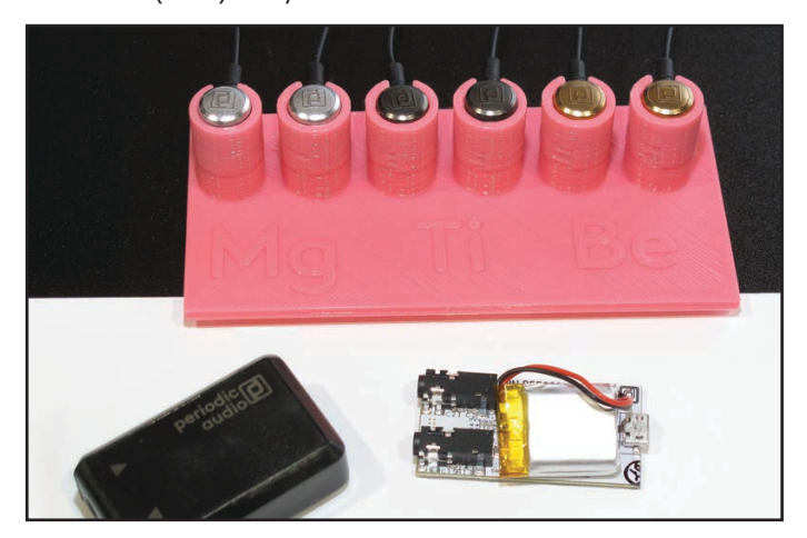
A prototype Nickel case and quad-layer PCB, accompanied by Periodic's trio of insert-style cans

Van Der Graaf MkII low-noise PSU, also $1,299. Pricing is not yet set on the Nash. The Joplin MkII offers variable gain with choice of digital de-emphasis and H/LPF. The revised Young handles DXD and DSD4, as well as analog and Bluetooth in. Though Der Bingle wasn't a rock star, the Crosby may just be, packing 110 W (4 \Omega ) of power into the same compact form factor as the rest of the line. Adding to the allure, the Van Der Graaf MkII acts as a power hub for the whole system, and features user-defined power up/down sequencing. Gurvey also had fidata's HFAS1-XS20U high-end music server, an upgrade to the XS10U, which now supports four RAIDed 1 TB SSDs. The pairs of striped drives, which optionally can be mirrored as well for increased data integrity, reduce current draw on the PSU. In turn, this improves fidelity as any server designer knows all too well. The HFAS1-XS20U runs $7,000 to $9,000, depending on storage complement (www.iodata.jp/fidata).