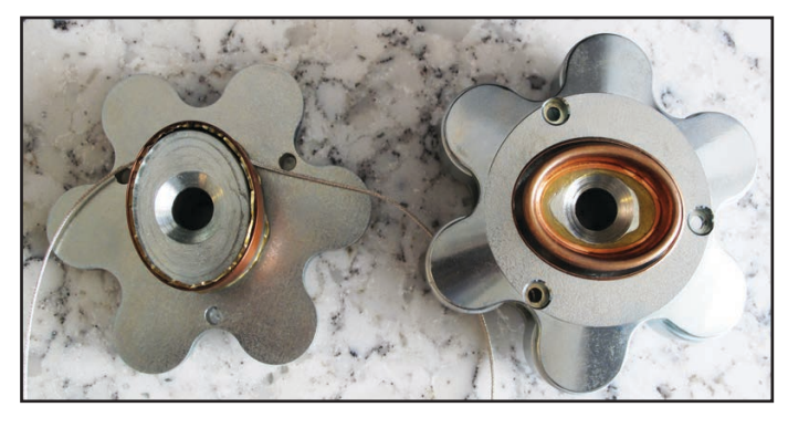
The guts of Ellipticor

With electrostats making something of a comeback, Woo was showing its latest, the lovely $8,999 3ES, an all-balanced headphone preamp/amp/energizer with a mad scientist vibe. Based on the