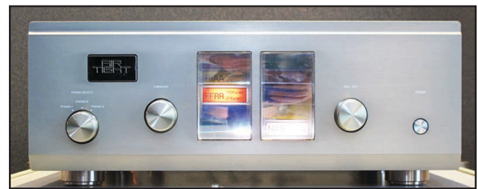
AirTight's ATE-301, a final product candidate in Golden Age champagne cosmetics

With a prototype having been shown at last year's Rocky Mountain Audio Fest, Classic Tube Audio was proud of a production example of its 2A3-based, $4,900 Whammerdyne DAA-3 (whammerdyne.com). A two chassis configuration, with a PSU base "docked" to the amplifier above, the DAA-3 flaunts DC coupling, wideband operation (-1 dB from 12 Hz to 95 kHz,