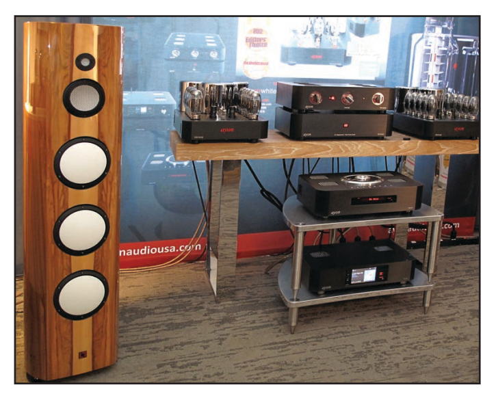
Dual Orthos II XS amps heat up the space.