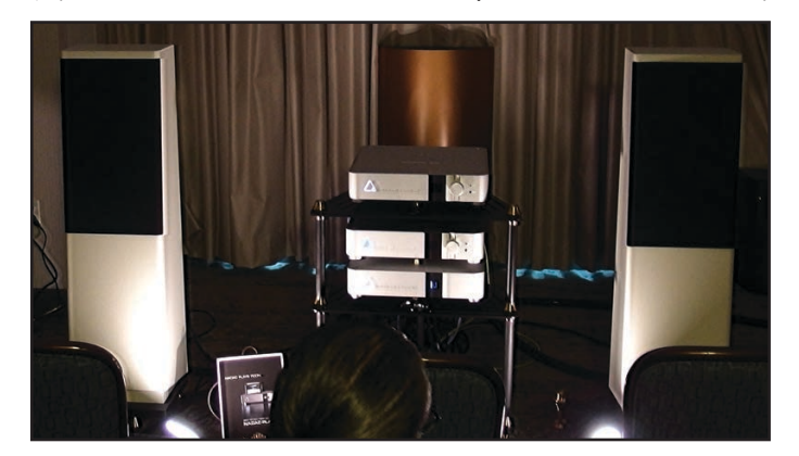
These still unnamed towers are PSI Audio's first high-end consumer product, reflecting the 40 years of pro audio analog design of the Swiss company.

Vehement Audio (www.vehementaudio.com) had its killer little $2,495 Brezza EOS on demo. A rear-ported bookshelf model,