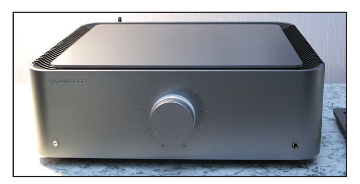
Cambridge Audio's new Edge W employs modified A/B operation for clean and efficient power...good looking as well!

In another Axiss room, I had a nice visit with the A&M Ltd.