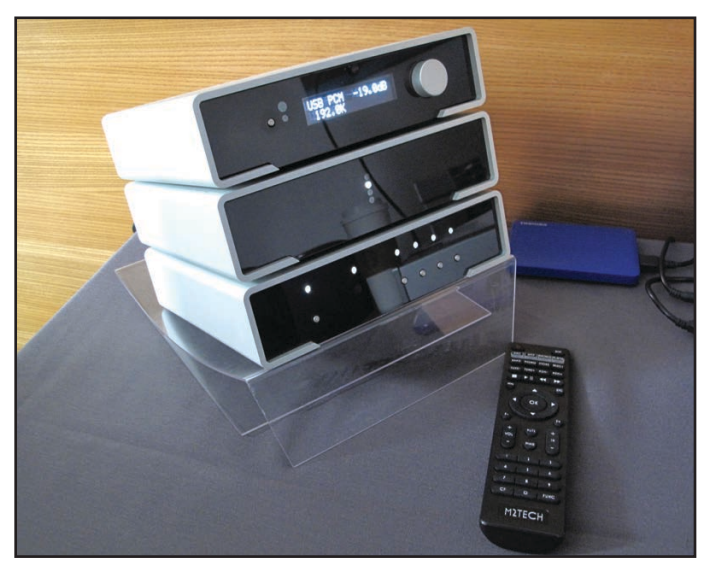
The Rockstars of M2Tech: Young MkIII, Crosby, and Van Der Graaf MkII